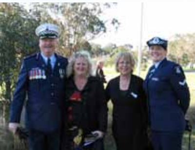
National Police Memorial