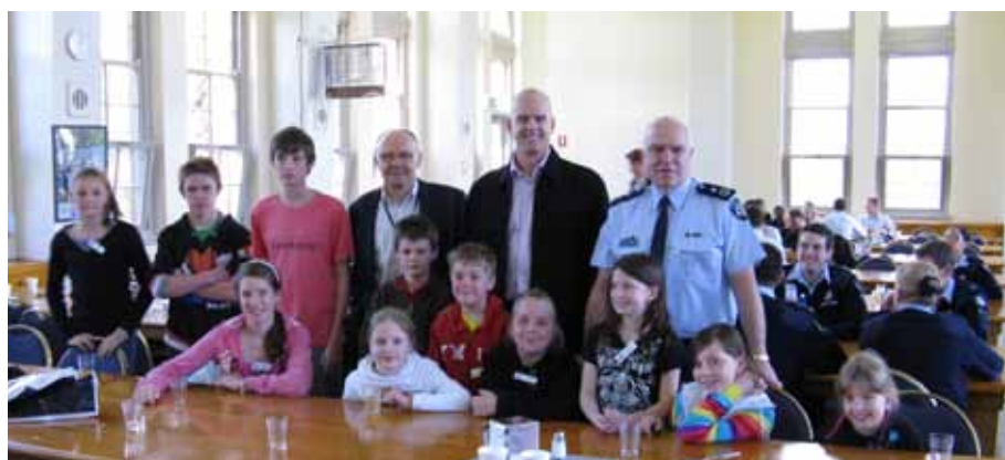
Chance meetings over lunch