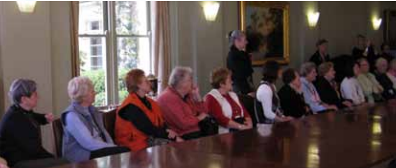
Government House Dining Room