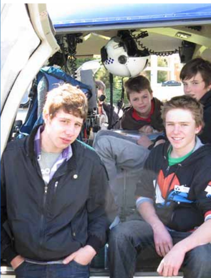
Pilots in the making?