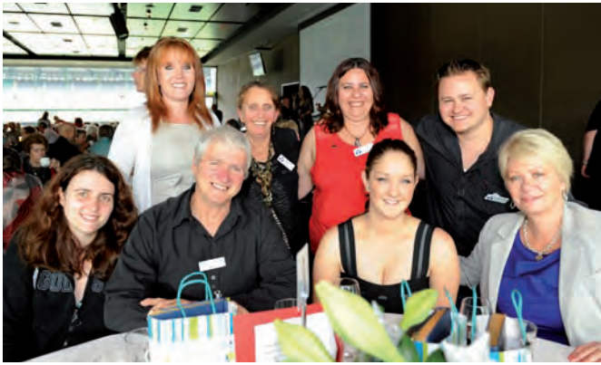
Legatees, police and other special guests enjoy the Victoria Police Legacy Christmas gala lunch at the MCG

A collage of photographs depicting the people and work of VPL over the years provided a timely reminder of the support and ongoing connection to the policing family that VPL offers. The extremely moving presentation