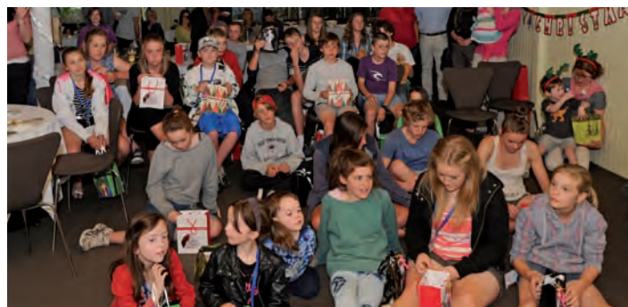
The annual VPL Children's Christmas Party was a popular event at the Melbourne Zoo last year