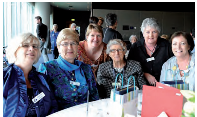
Legatees, police and other special guests enjoy the Victoria Police Legacy Christmas gala lunch at the MCG