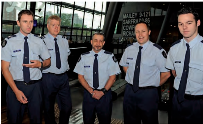
Local uniform police provided a welcomed presence at the annual VPL Christmas lunch, mingling with legatees and providing a modern perspective on policing.

included early photographs of legatee children who now have their own children and some very interesting hairdos and outfits!